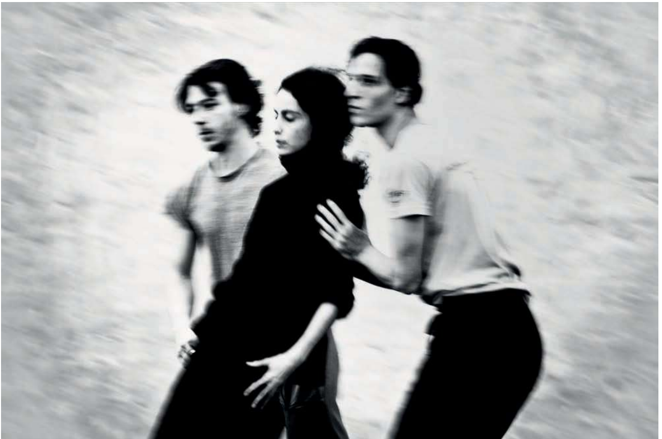
Playing Identities: Creolisation, Creation, Migration